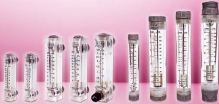
Panel Type Flow Meter (FMZ-SERIES)