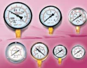
General Pressure Gauge Liquid Filled Pressure Gauge Vacuum Gauge