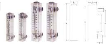
The outline size of FMZ-Series flow meter