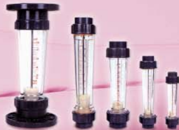
Plastic Tube Type Rotameter Flow Meter (FMS-SERIES)